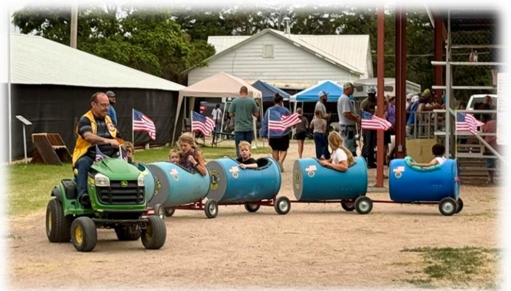
Above: Smith Center Lions Train

Smith Center provided a free train ride for children at the local community fair. They stayed an extra night this year to allow even more fun for the youngsters!